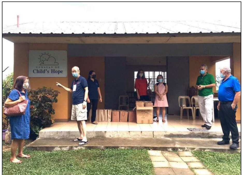
Software company SunFish DataOn donated Christmas bags for the children. These went out with the second batch of school material delivered to the children's homes in December.

We ask each parent to send in a picture of her child and his or her seatwork, everyday. This is part of the attendance report. At the same time we get necessary feedback on the children's wellbeing and their progress.